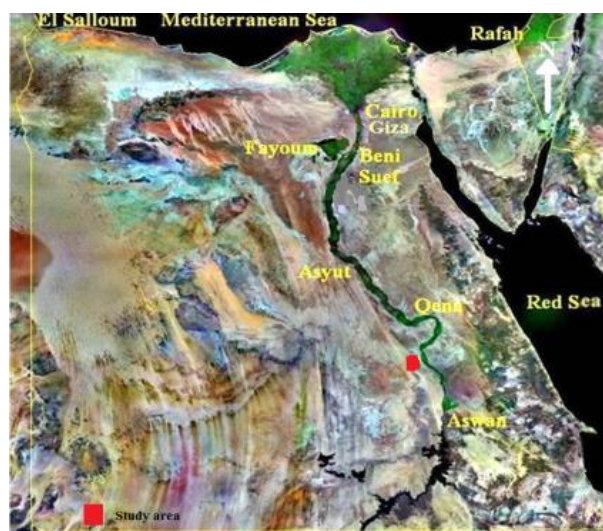
Fig (1). Location map of the area

The Western Desert of Egypt stretches westwards from the Nile Valley to the borders with Libya and south wards from the Mediterranean Sea to the borders with Sudan. It occupies an area of 680,000 km 2 (About 68% of the total area of Egypt). The studied area is located in the south eastern part of the Egyptian Western Desert. It is located west of Idfu district Aswan Governorate and bounded by latitudes 24° 22' - 38" and 25° 8' - 36" North and longitude 32° 29' - 45" and 32° 47' - 13.32" E with area about 580 km 2 (139,000 feddans), Fig(1). The main road in the studied area is Assuit – Aswan western desert road which connects Assuit and Aswan governments.